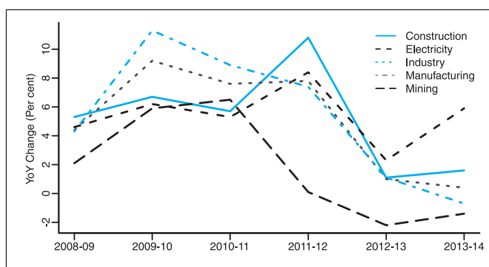
Figure 9.1 : Sector-wise Growth of Industry GDP (per cent)

Key reasons for poor performance have been contraction in mining activities and deceleration in manufacturing output.